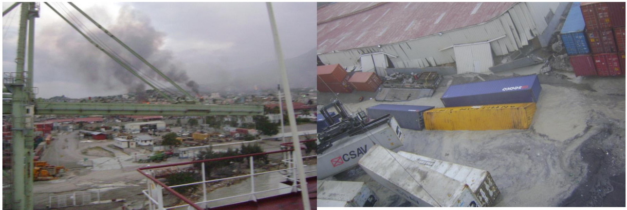
Photos of Haiti's damaged infrastructure in the days immediately following the earthquake.