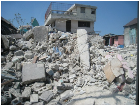
Devastation in Port-au-Prince.

On Tuesday, January 12, 2010 Haiti experienced a 7.0 magnitude earthquake, with an epicenter just 16 miles west of Haiti’s capital, Port-au-Prince. The capital city itself was largely leveled. The Presidential Palace and Parliament were destroyed along with many other structures. As a result of the earthquake, an estimated 3 million people to date have been injured, displaced, or otherwise affected. An estimated 230,000 have died, with 300,000 left injured and another 1 million left homeless. As the poorest country in the Americas with the lowest healthcare spending in the western hemisphere, many rural Haitians lack even basic healthcare.