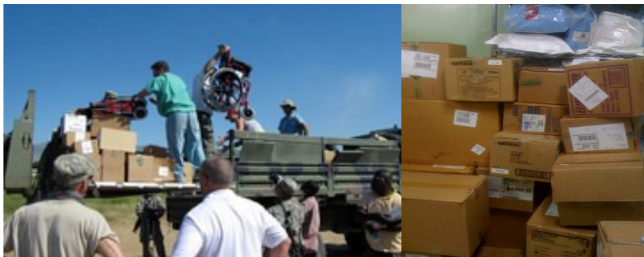
Delivering supplies in Haiti. Due to MedShare’s unique online inventory process, supplies arrive pre-sorted and by request so that nothing is ever wasted or assumed to be needed.

“I’ve traveled to 38 countries and I’ve never witnessed the mass pain and suffering like I did on this trip to Haiti. It was emotionally draining, but incredibly inspiring to see the strength of the Haitian people, both the victims and the family members supporting them with love and care. In the midst of this emergency, I witnessed firsthand the success of MedShare’s operations. When donations from some organizations came in, I saw medical professionals having to take time away from the patients to sort and organize the various medical products. In contrast, MedShare donations would arrive and go immediately to use because they were already sorted, labeled and ready to go. We got needed medical supplies into the hands of physicians, and it made me proud that our staff, donors and volunteers made all this happen.”