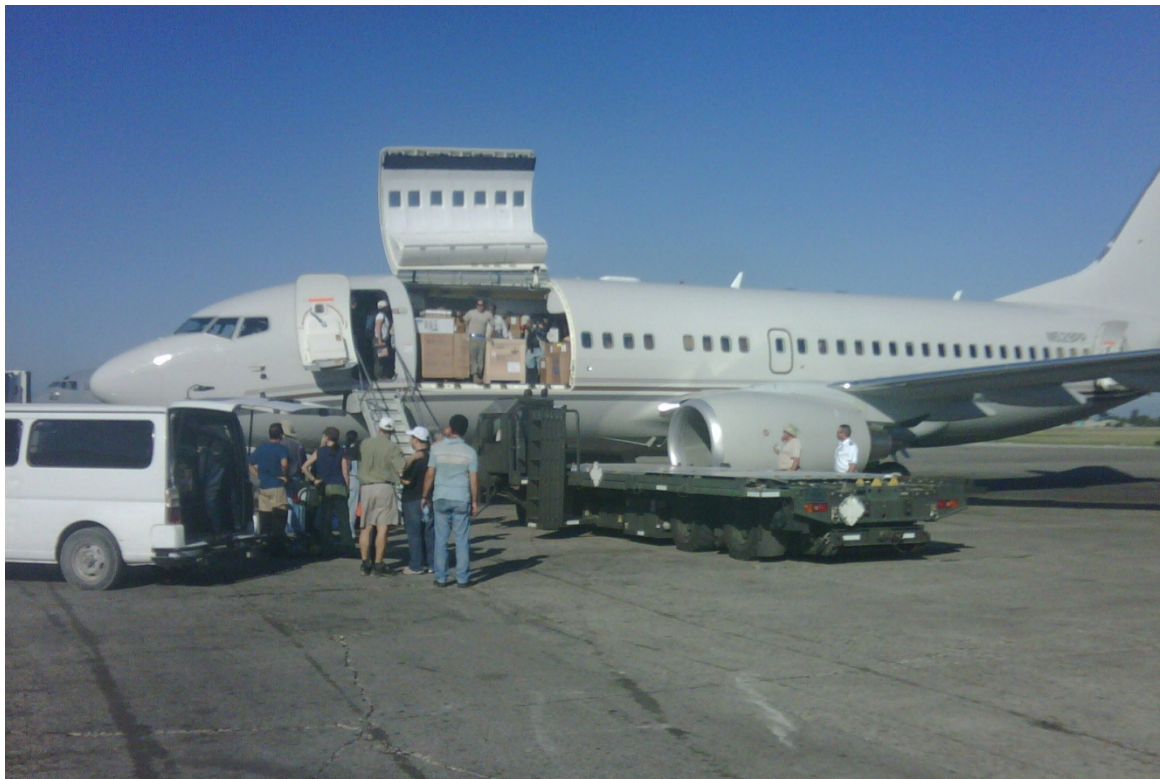
Due to the devastation of the Port-au-Prince port and nearby Port Cap-Haitian, initial supplies had to be air-lifted to Haiti.