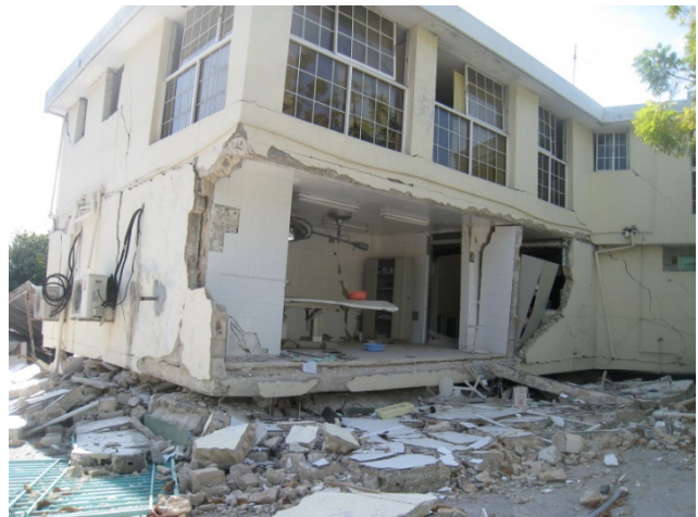
Hopital Trinite - One of many Haitian hospitals destroyed in the earthquake visited by MedShare staff.

MedShare has 10 years of experience sending medical supplies and equipment to Haiti. Prior to the earthquake, we had sent 37 tractor-trailer sized containers of medical supplies and equipment conservatively valued at $5.6 million to various hospitals in Haiti. MedShare has responded to the disaster in Haiti by sending life-saving medical supplies and equipment to treat the millions of people affected by the 7.0 magnitude earthquake that rocked the country. In catastrophes such as this, MedShare is able to provide for items of the greatest need including basic first aid supplies, sutures, oxygen masks, surgical steel instruments like dressing and trauma scissors, as well as orthopedic equipment such as splints and backboards.