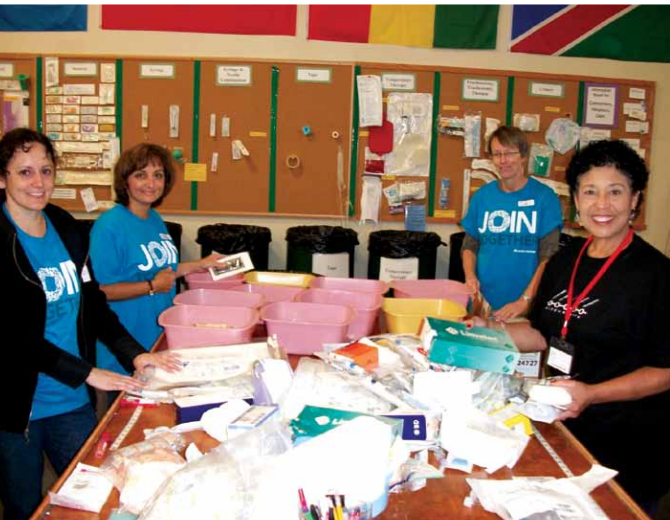
Kaiser Permanente volunteers at MedShare's Western Region.

volunteers make our work possible. Our operations depend on dedicated individuals and groups to help us bridge the gap between surplus and need.