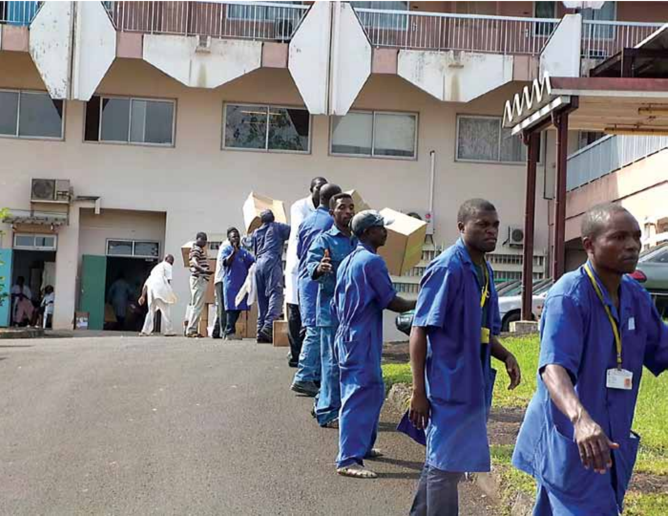
Cameroon's Hopital General Douala staff unload a container.

“the coca-cola africa foundation’s seven year partnership with MedShare has proven to be one of the most pragmatic, effective and sustainable needs-driven interventions addressing Africa’s health issues.”