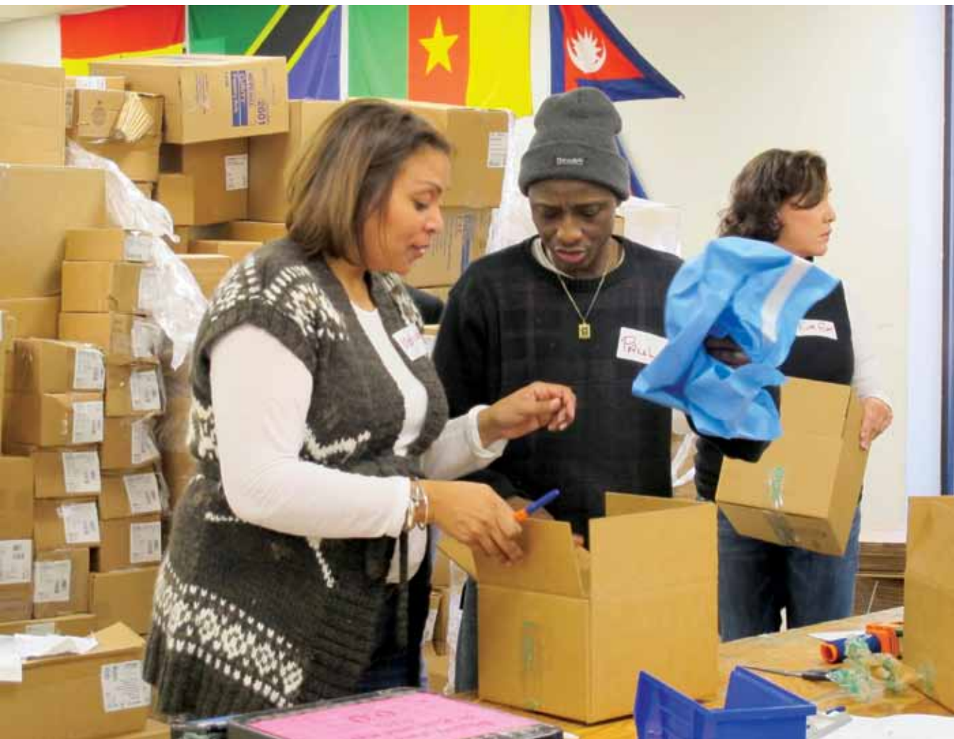
Volunteers sorting medical supplies donated by Covidien.