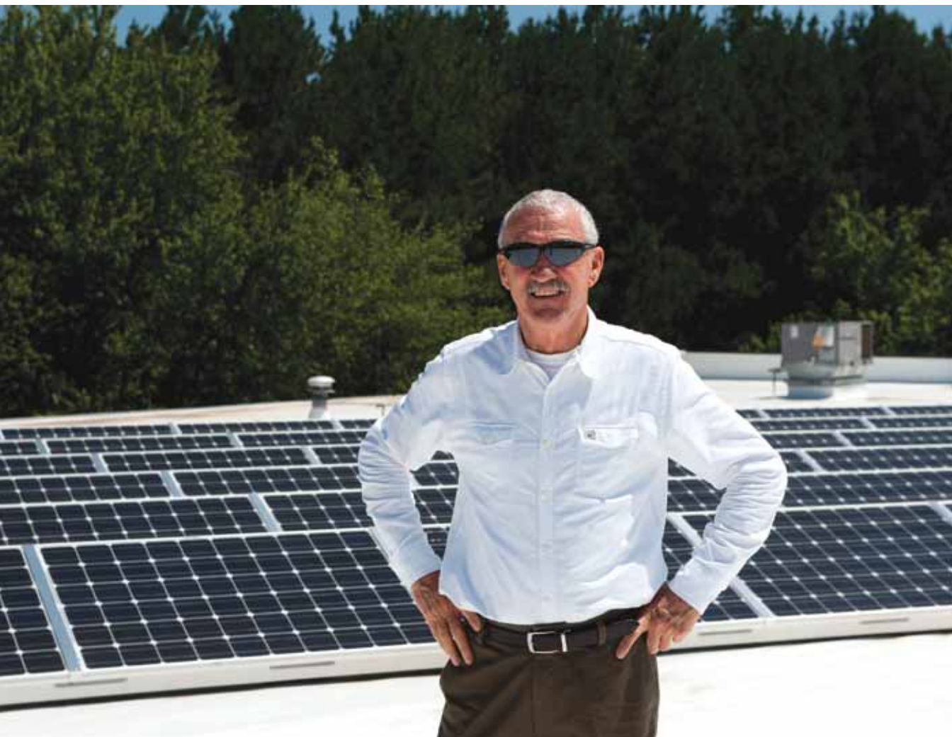
As part of the Georgia Non-Profit Solar Project, Radiance Solar installed 105 solar panels on our Southeast Region Distribution Center.

we are green. our mission is to deliver medical supplies to underserved populations around the world while lessening the impact of medical waste in the United States, but did you know that we've taken great strides over the past few years to make our operations and warehouses more environmentally-friendly as well? It all adds up.